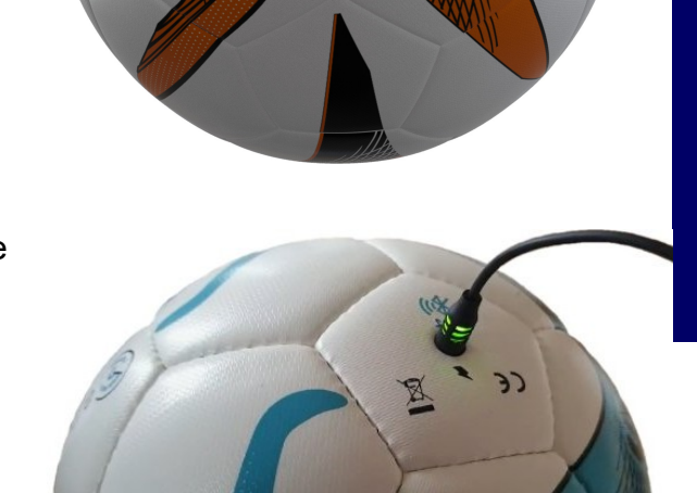
PURE magnet-USB connector, charge cable included 500mAh LiPo battery